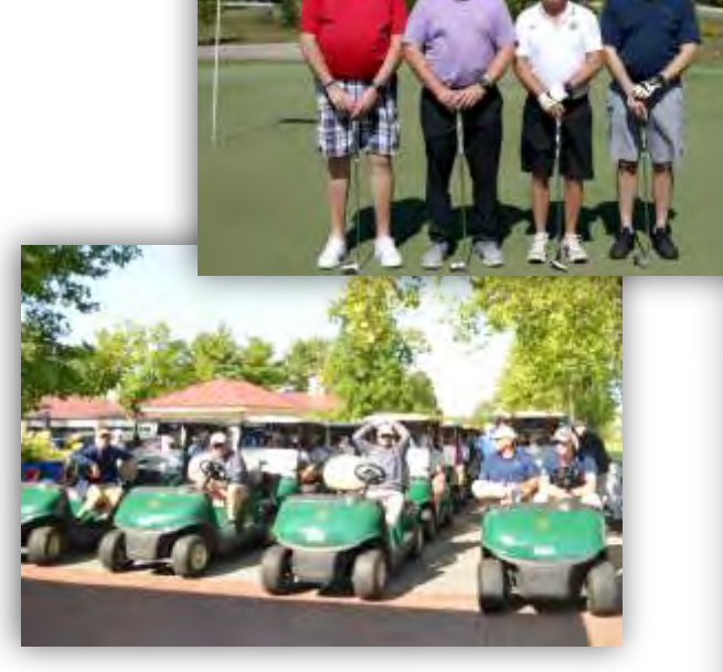
Detailed information about sponsorship opportunities and packages is available in our Event Package information.

Sponsor Packages for Every Budget Provide Maximum Visibility and Exposure Across Multiple Channels